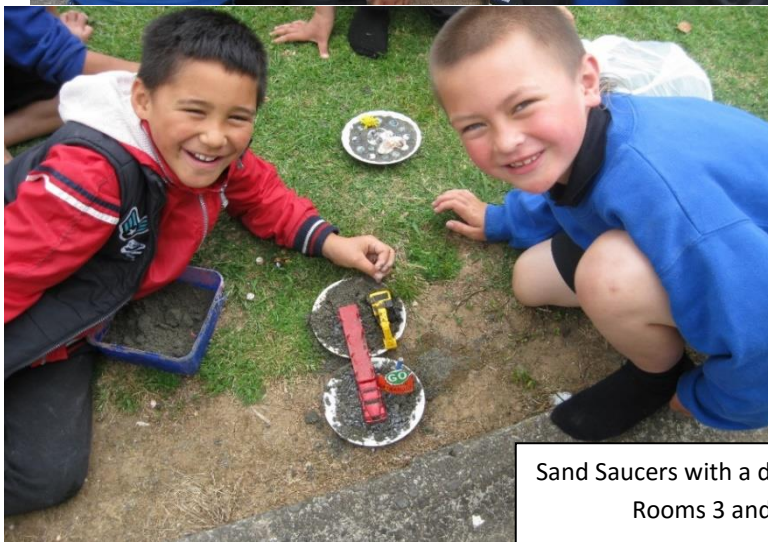
Sand Saucers with a difference. Rooms 3 and 14