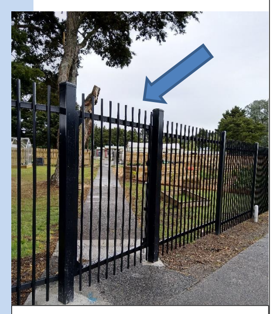
A friendly reminder that this gate will remain unlocked at all times so that everyone has access to the community garden.