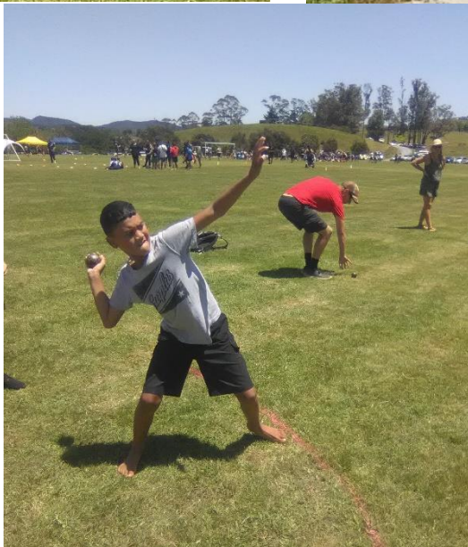
Athletics Day – Haruru Falls