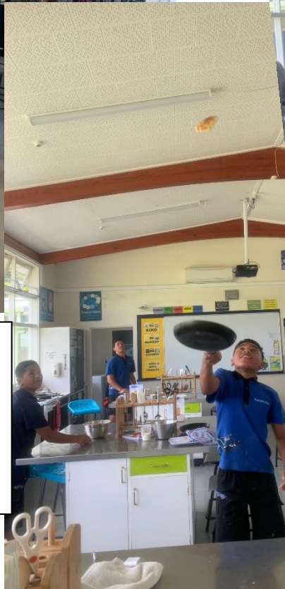
Pancake tossing day in Whaea Dot's food technology class.