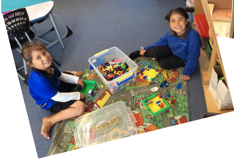
Room 2 – Happy Faces