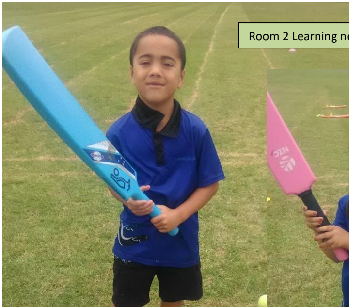
Room 2 Learning new cricket skills