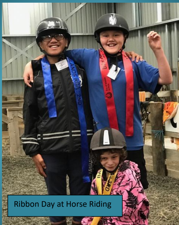
Ribbon Day at Horse Riding