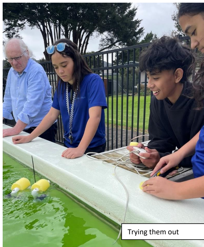
Trying them out