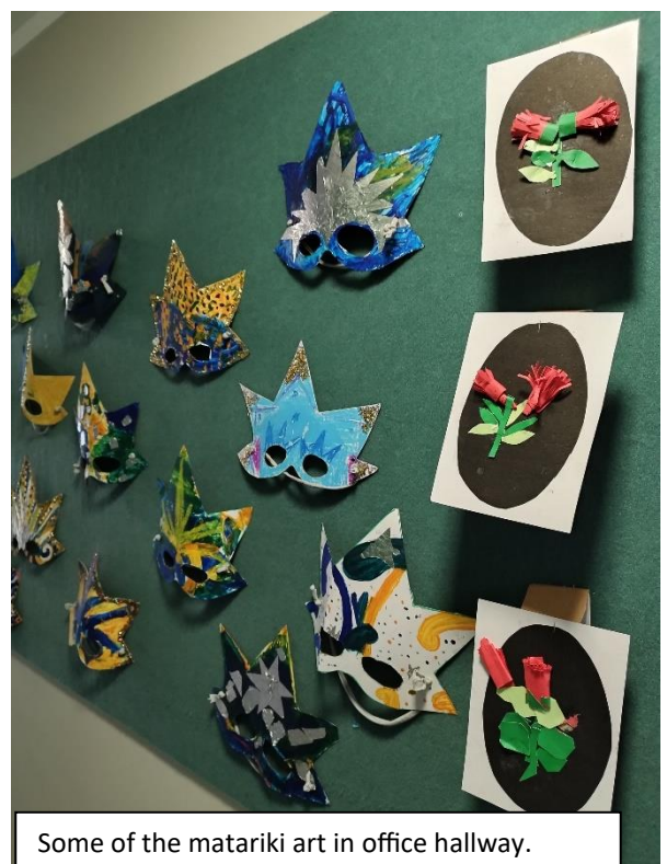
Some of the matariki art in office hallway.

In Week 9 we have our annual inter-whanau cook-off between Tere Awatea, Taumarere, Otiria & Waiharakeke. Who will take out the competition this year? Participants are required to use key ingredients from the moana, ngahere or the awa. They will receive support from their Pouwhirinaki.